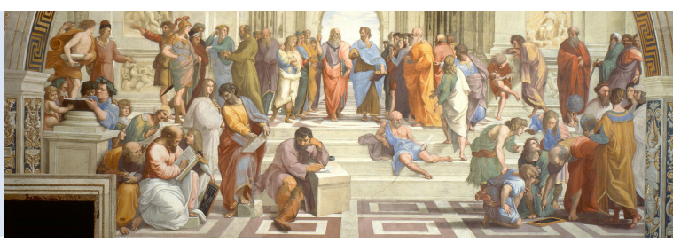
The School of Athens - Raphael

Meeting time/location: M/W 9:00-9:50 in CBB 271